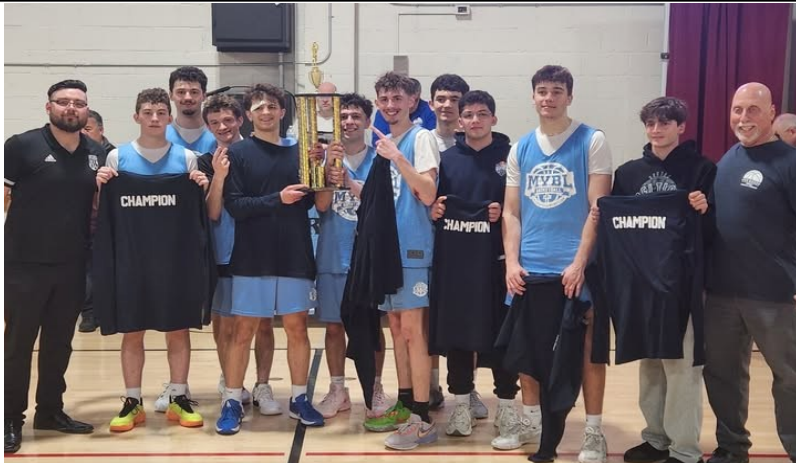
Congratulations to the Boys High School Team for winning the Agganis Tournament.