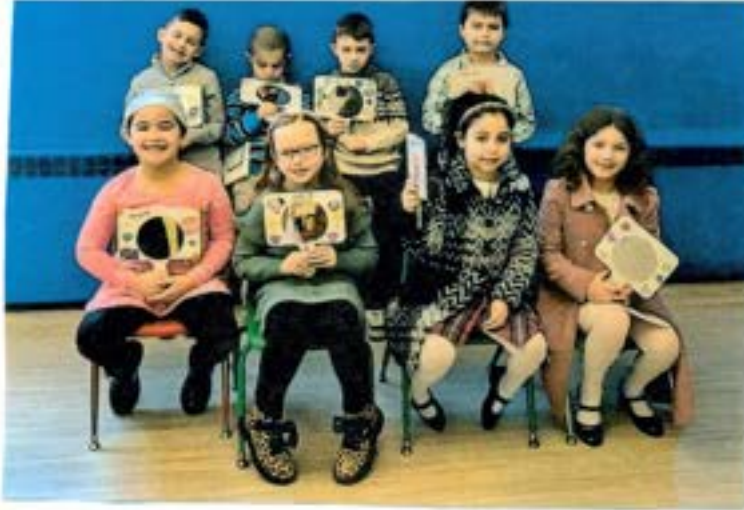
Grade 1 - Made in the Image of Christ