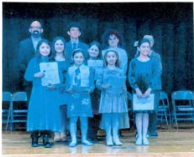
2026 Oratorical Festival participants