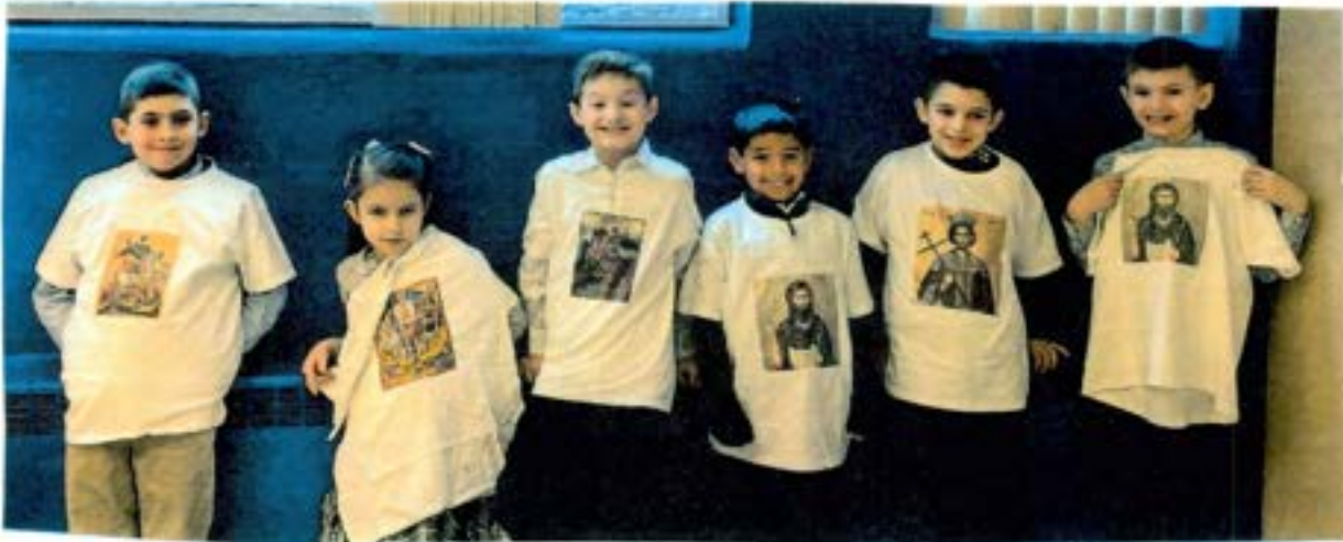
Grade 2 – Super Saints Party