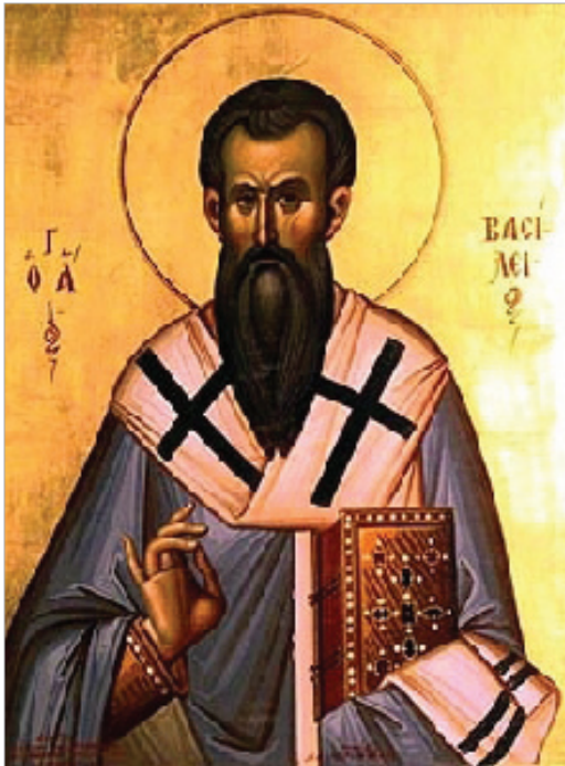
St. Basil the Great

Today, this ministry brings the expertise of a nurse into the parish to help reclaim the church's role as a place of healing and wellness.